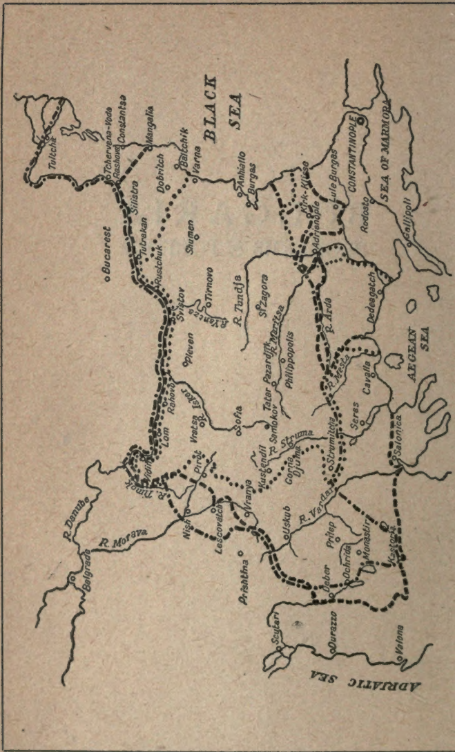
- · - · - · The Bulgaria of the Constantinople Congress (1876) - - - - - " " of San Stefano (1878) · · · · · " " Bucarest (1913).